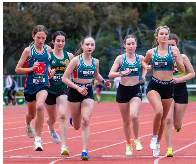
The girls setting off for the mile race