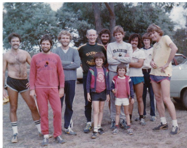
Taken in the late 70s out at Yarrambat after one of our handicap races.

Back in those days we would venture out to Yarrambat for our 6k or 8k handicap races at the start of each cross country season. Typically, the course was hilly on unmade roads and in those days, very little traffic.