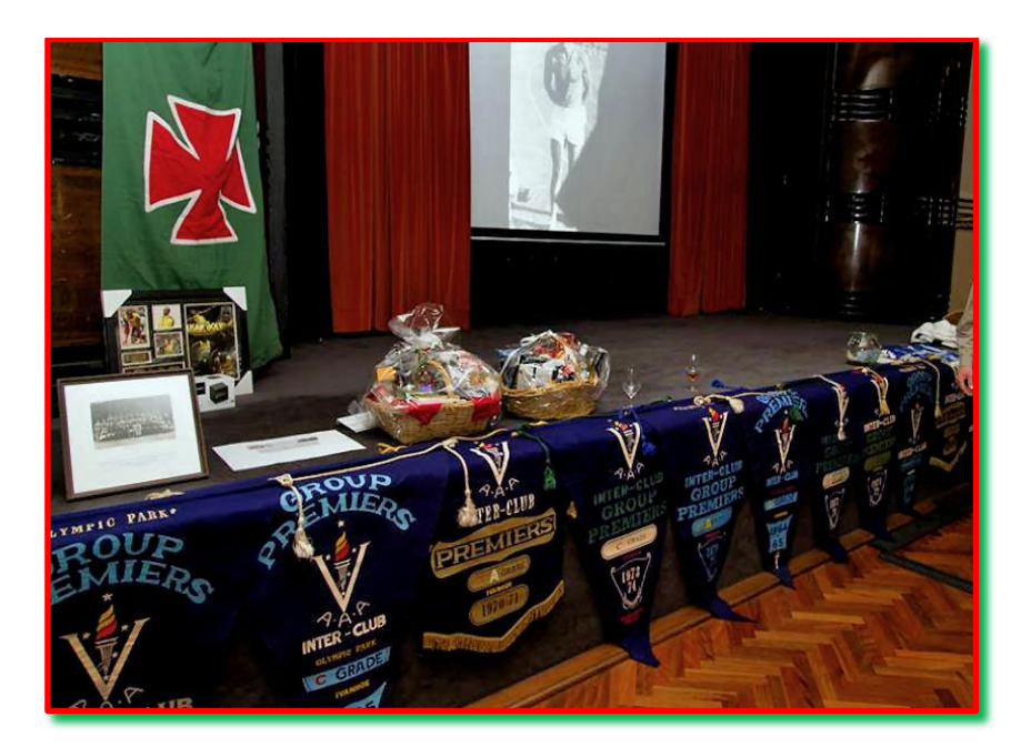
A small selection of the clubs premiership flags

Thanks to the sponsorships the dinner achieved a small profit, the raffle made $916 and to date we have sold 136 books which together with the generous underwriting sponsorship of Miles Real Estate means we now have a profit on the book of over $2,000. A great result which helps put the Club in a stronger financial position as it enters the new century.