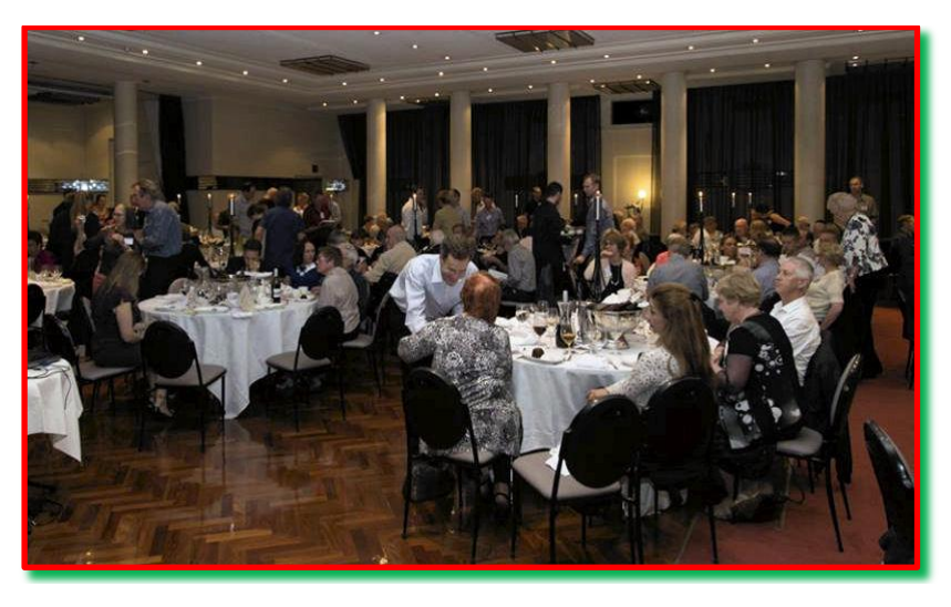
The Streeton Room in the Centre Heidelberg

fantastic gathering of two-hundred and ten past and present members, descendants and families, were joined by the sponsors at this gala event to celebrate a centaury of athletics with Ivanhoe Harriers. The event was held in the Streeton Room in The Centre Heidelberg and the buzz of excitement and conversation hit you as you approached the entry foyer, hastening your feet inside.